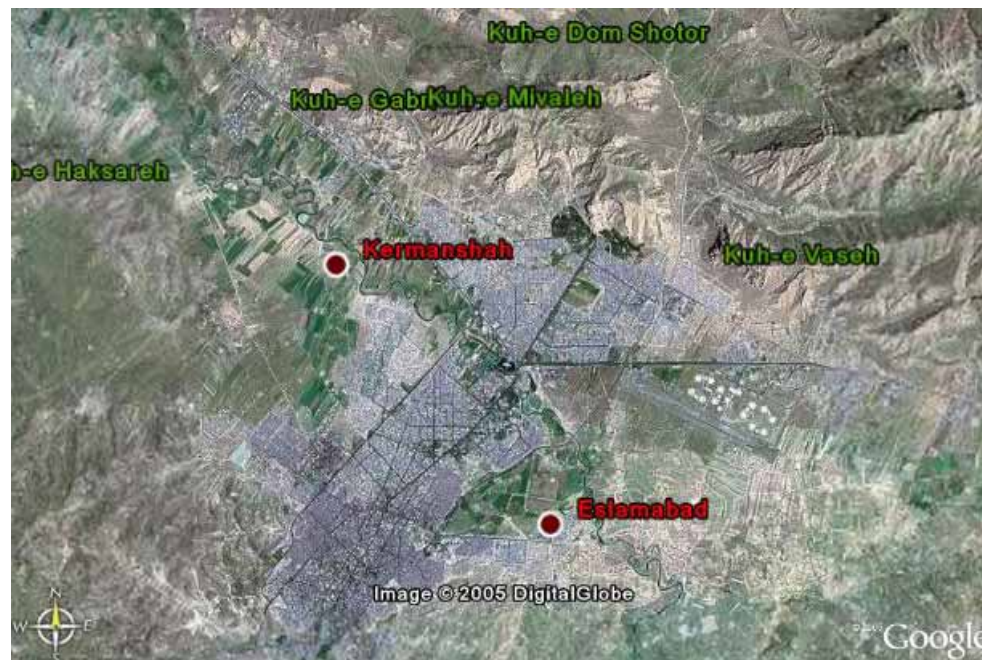
Figure 1: Kermanshah and the microzonation